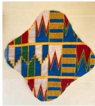
Kitengye (African outer fabric)